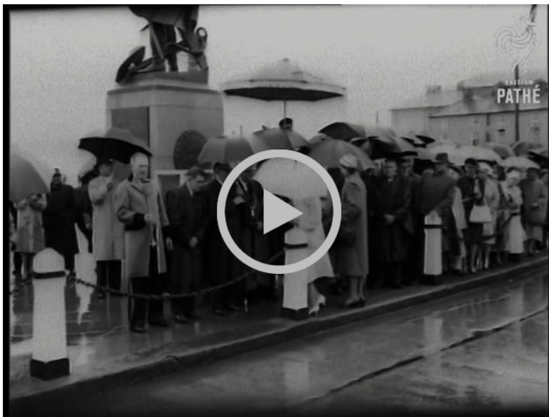
Video: Eisenhower In Ireland (1962)

The historic visit was particularly meaningful as it helped to signify an end to a perceived period of distrust between the two countries stemming from Ireland's official neutrality in World War II. In 1962, Eisenhower in turn visited Ireland where he placed a wreath in Wexford at the statue to Commodore John Barry, "the father of the American Navy," which the U.S. had gifted to the people of Ireland in 1956.