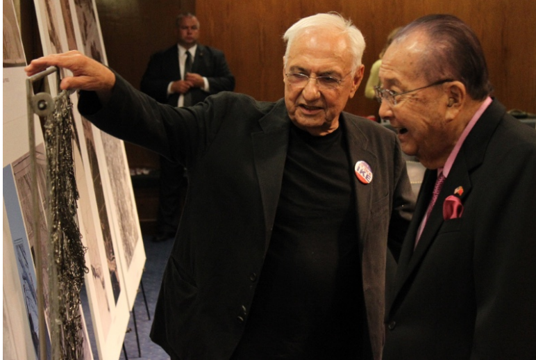
Memorial designer Frank Gehry presenting design concepts to Senator Inouye at the Eisenhower Memorial Commission meeting, 12 July 2011

Fittingly, it was the late Hawaii Senator and World War II hero, Daniel K. Inouye, who was an original co-sponsor of the legislation that established the Eisenhower Memorial Commission. Serving as the Commission's Vice Chairman from 2001 until his passing in 2012, Senator Inouye championed our mission to build an enduring memorial to the Supreme Allied Commander in World War II and the 34th President. Completing the mission will also be a lasting tribute to Senator Inouye's leadership.